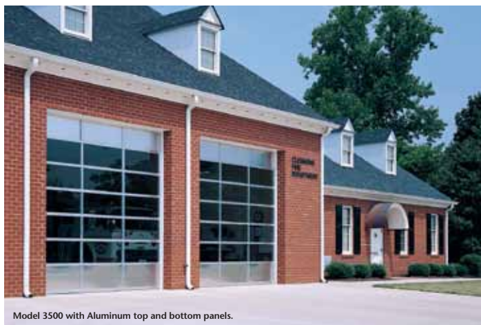
Model 3500 with Aluminum top and bottom panels.

NEW! A stylish aluminum strut, that does not restrict viewing area, is available for large door applications up to 24' 2" on the Model 3550.