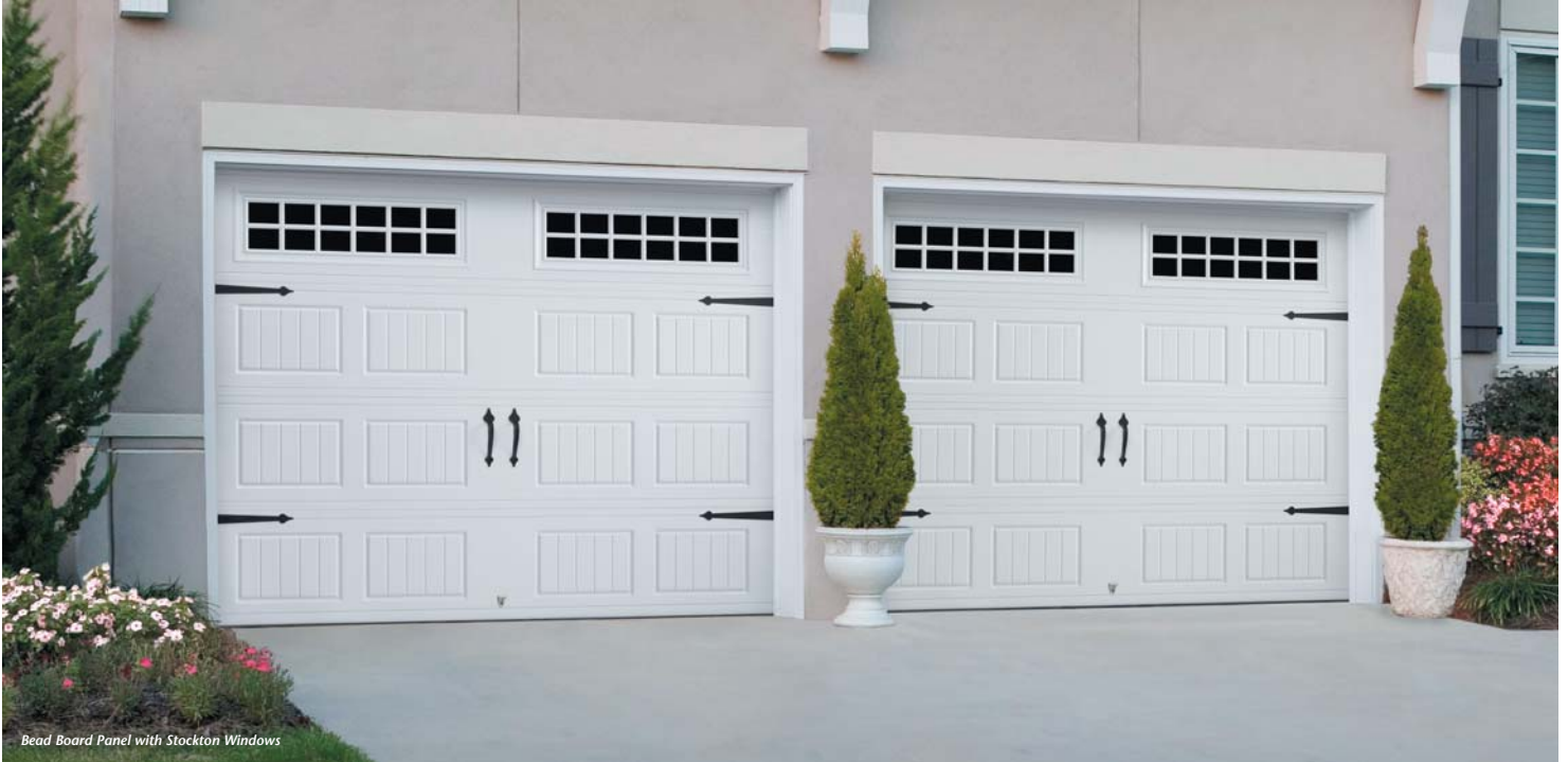
Bead Board Panel with Stockton Windows

Design and energy efficiency make the Designer's Choice doors popular models. With triple-layer construction, a thermal seal, and superior insulation R-value of 15.67 or 11.04, these durable, low-maintenance doors give you the ultimate in quiet operation and energy efficiency.