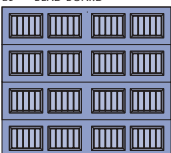
SP • BEAD BOARD