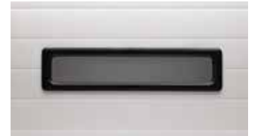
24" X 6" DOUBLE INSULATED ACRYLIC WINDOWS WITH BLACK FRAME