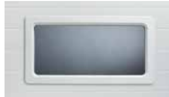
24" X 12" INSULATED GLASS Available with either a black or white frame.