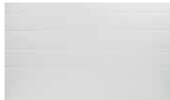
PENCIL GROOVE PANEL WITH STUCCO EMBOSSMENT